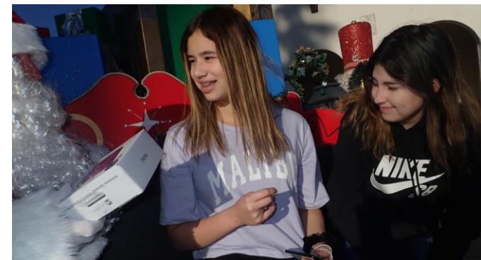
Kids of all ages

DEPARTMENT OF THE ARMY DIRECTORATE OF FAMILY AND MORALE, WELFARE AND RECREATION BLDG 1317, NORMANDY DRIVE, P.O. BOX 105094 FORT IRWIN, CA 92310-5000