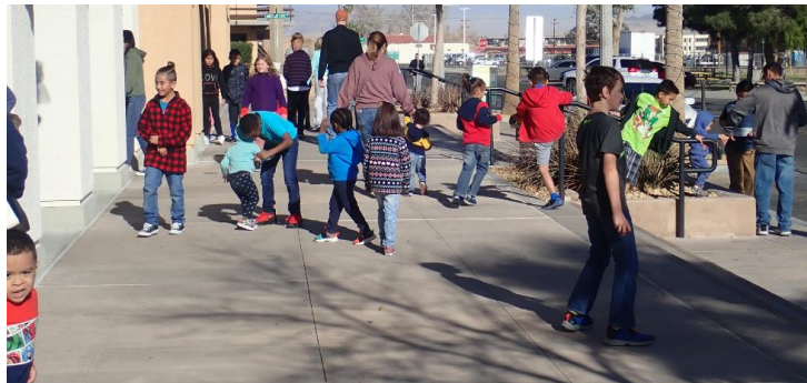
Left: lots of kids