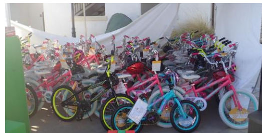
Top left: Santa & Mrs. Claus. Center: Mrs Claus & one of her elves. Right: Bikes and more bikes.

Ft. Irwin toy distribution took place Saturday January 11 when the troops had returned from their Christmas leave. We were told there were 3000 kids this year. Four hours to take care of them all.