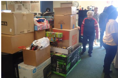
Mrs. Claus eyeing all the goodies before the real work begins