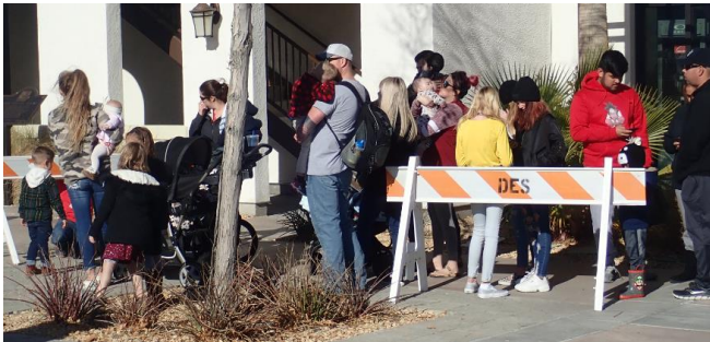
The troops, & kids, are ready