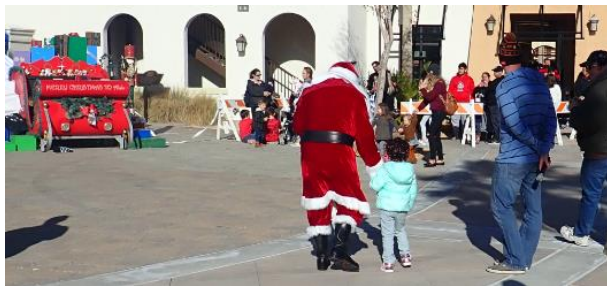
Above: Santa working the crowd