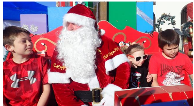
Right: toy distribution has finally started