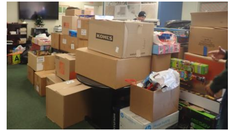
Fewer toys this year...there was still room in the office