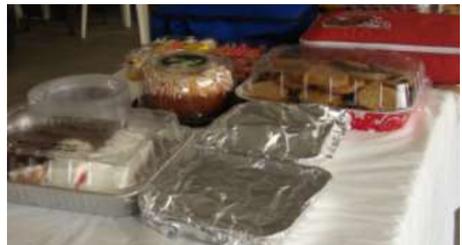
Partial desserts before, not much left to take pictures after