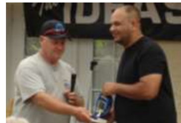
A few of the opportunity drawing winners