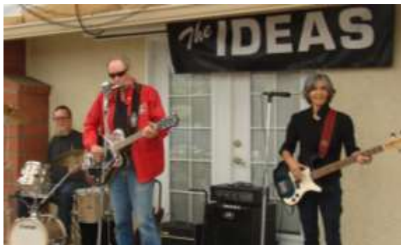
The band, The Ideas