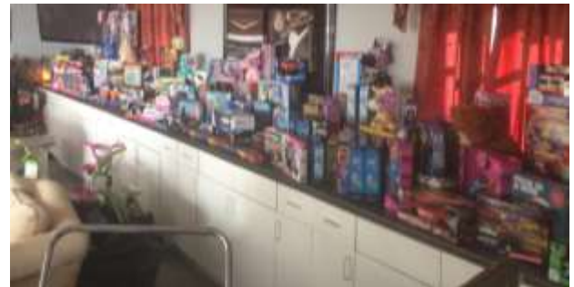
This does not include the Chaffey College donations or the Ramona Tire donation